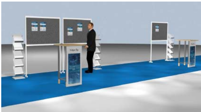
Large stand on the left and small stand on the right